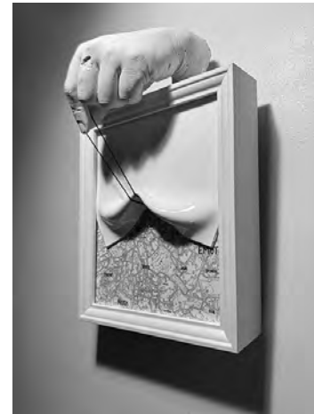
Puppet Master 2024 Frame: 20 x 25 cm Mixed media £POA