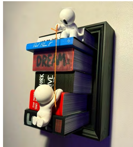
Books Hands Unconditional 2024 Paper + mixed media £POA