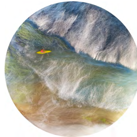
Drifting & Dreaming in Turquoise Bliss 2024 86 x 86 cm Wool £2600