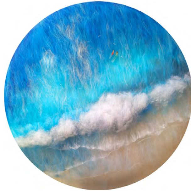
On Remembered Wings 2024 64 x 64 cm Wool £1800