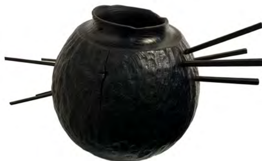
Vessel I-IV Various sizes Wood £500-1500 each