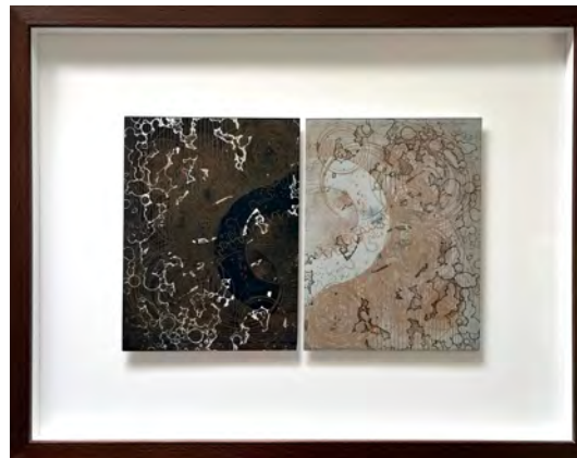
Occultation Duo III Etching 40 x 50cm £550