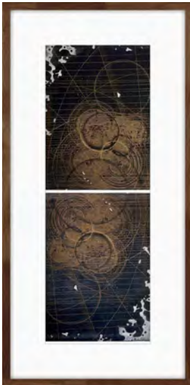
Ascend Etching 58 x 32 cm £550