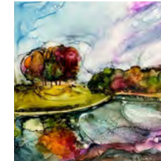
Heather on Illkey Moor Spring Sunshine The Magical Land Walk Around the Lake