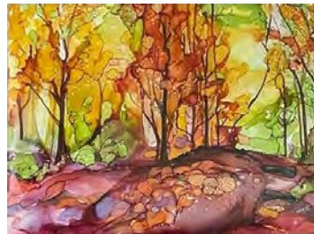
The Life Within H58 x W75 cm framed £1100