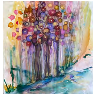
Fjords Ahoy The Canopy